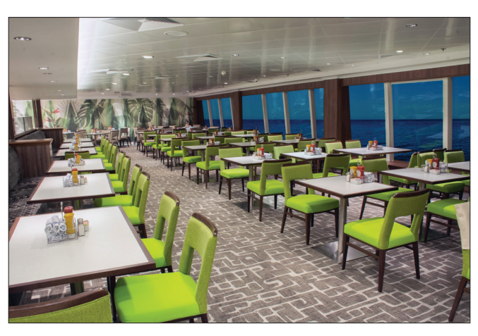
Garden Café (Buffet)