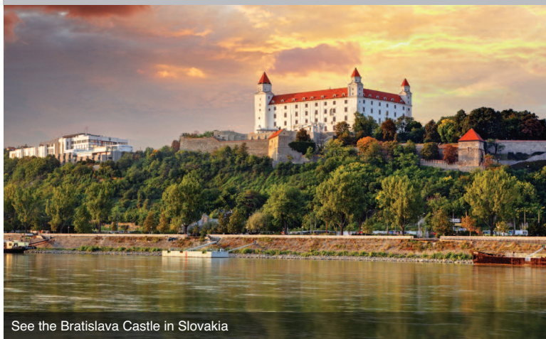
See the Bratislava Castle in Slovakia