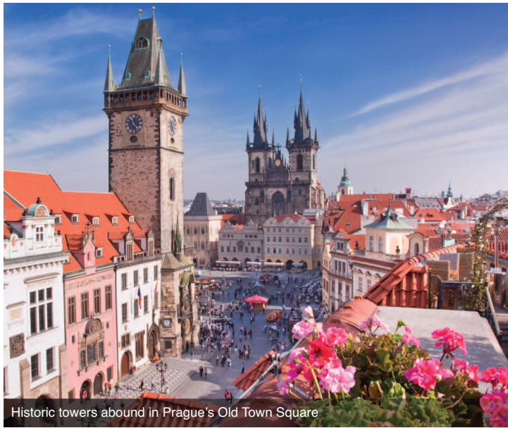
Historic towers abound in Prague's Old Town Square

itage that has bestowed it with many dazzling palaces and monuments: the lavish Hofburg Palace, the impressive Vienna Opera House and the majestic Ringstrasse. The capital is also known as the “City of Music” for having once been the home of composers such as Beethoven, Schubert, Mozart and Johann Strauss. On your included excursion, see some of the famous sights of this impressive city and visit Schönbrunn Palace, with its magnificent interiors and landscape gardens. Enjoy leisure time in the city center in the afternoon. This evening, join an optional excursion for a musical concert in one of the famous music venues of the city. (Breakfast, lunch, dinner and evening snack onboard)