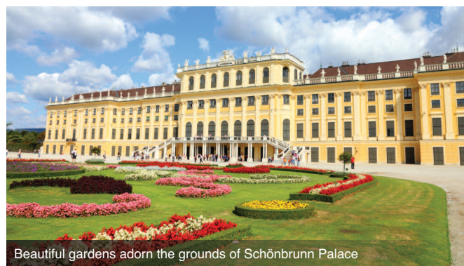
Beautiful gardens adorn the grounds of Schönbrunn Palace

Discover all Vienna has to offer with an included orientation tour. For over 600 years, the magnificent baroque capital city of Vienna was the seat of the mighty Hapsburg Emperors, a her-